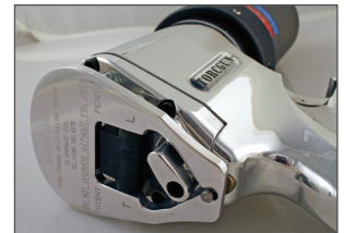
AVAILABLE WITH SAFETY LEVER

This patented safety mechanism drastically reduces the risk of operator injury. The lever must be depressed while pulling the trigger, ensuring that hands are clear from pinch points.